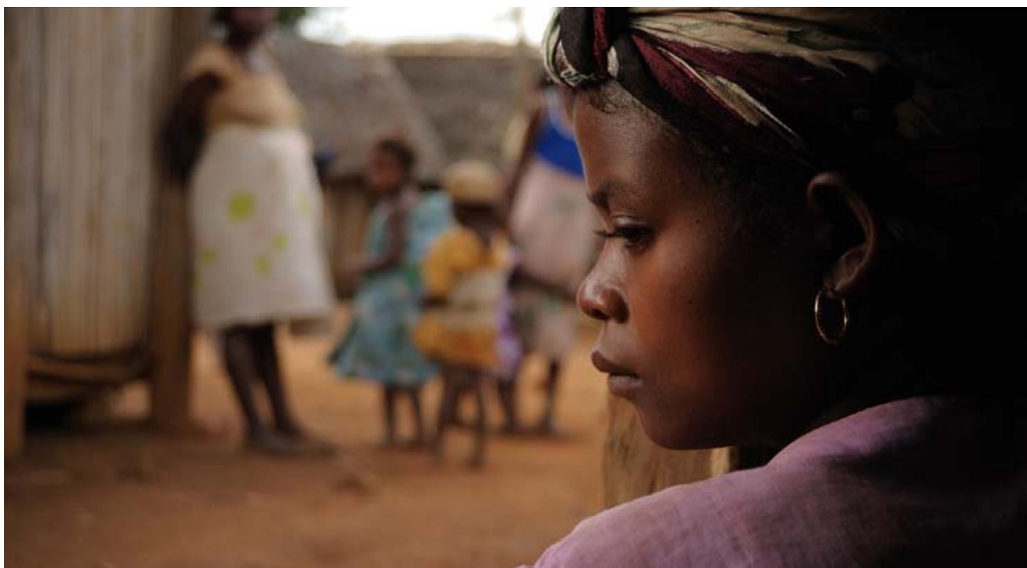
The Government of Madagascar's family planning programme, which uses a semi-autonomous not-for-profit organization for contraceptive procurement, is working to improve maternal health.