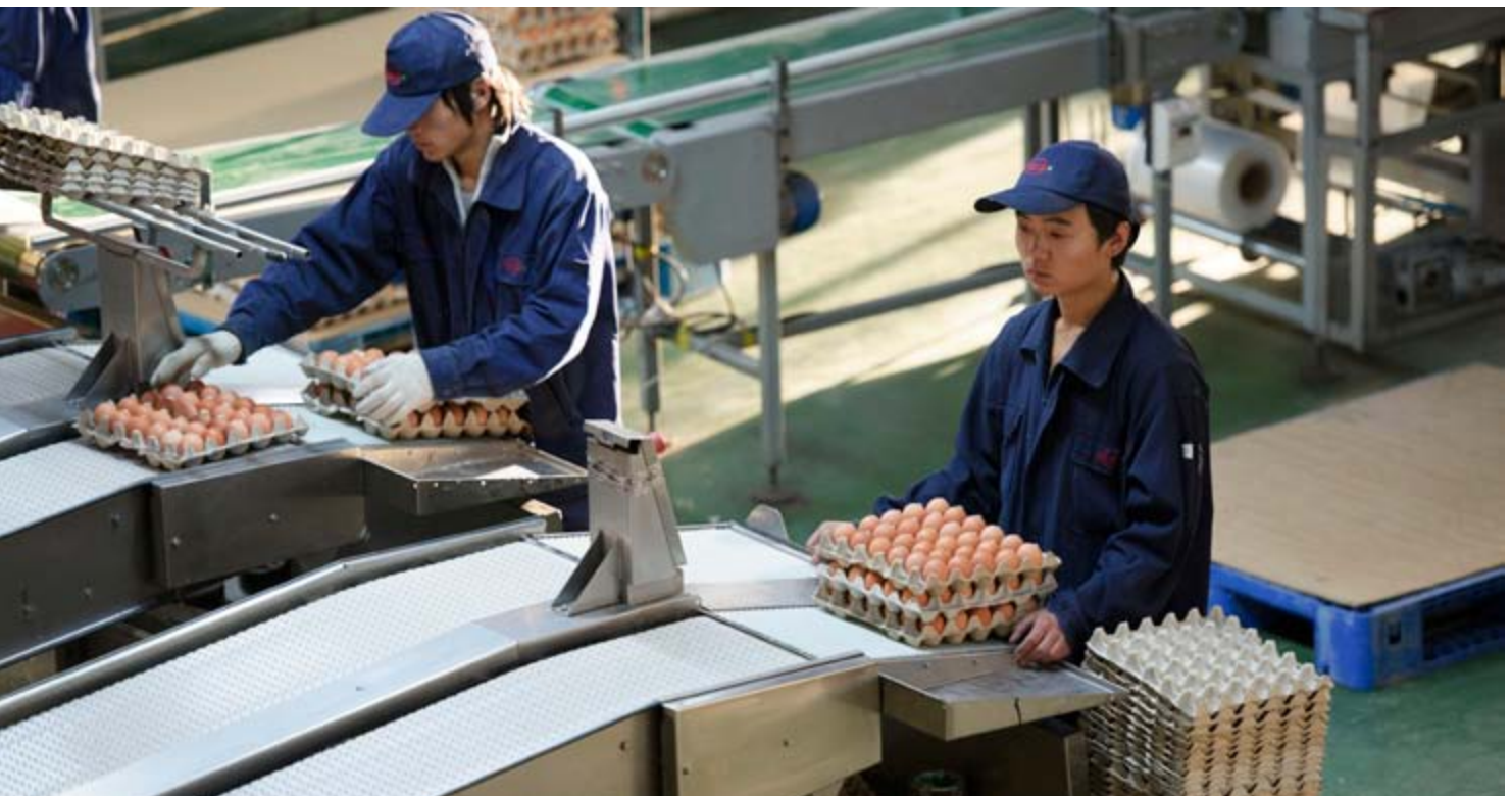
Workers inside the egg processing plant at the Beijing Deqingyuan Agriculture Technology Company in Beijing, China. The company is home to a project supported by the UN Development Programme (UNDP) and the Global Environment Fund which uses manure and water waste from some 3 million chickens to produce biogas for electricity.

Finally, the government should consider providing subsidies to allow the procurement of green products at a higher price than the market. The government can also offer tax breaks to encourage green production and consumption and levy higher taxes on products that cause pollution and over-consumption.