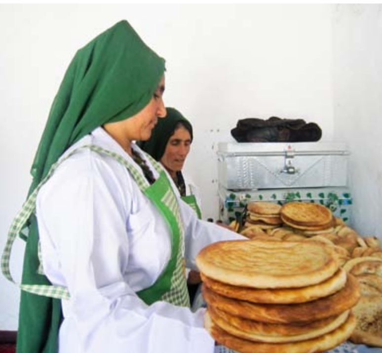
A women's group set up a bakery with the support of the Sida-funded project in order to sell bread to workers and bus passengers.

advantages of bringing money into the community and providing women with new skills, as well as promoting the idea that women can be key economic players in society.