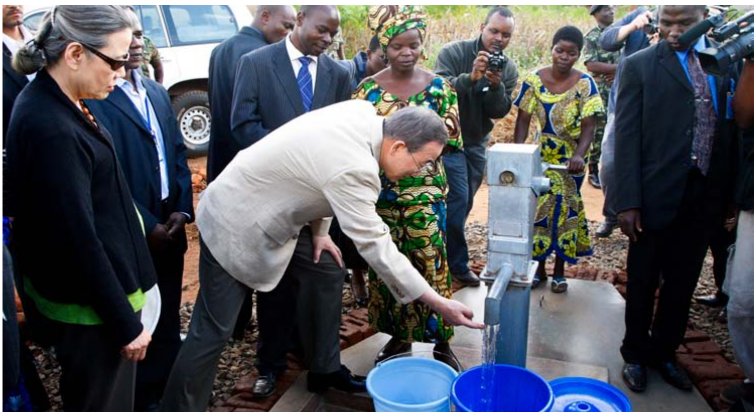
Secretary-General Ban Ki-moon and his wife, Yoo Soon-taek, test a communal water pump at Mwandama Millennium Village, Malawi. The Millennium Villages are based on a single powerful idea: impoverished villages can transform themselves and meet the Millennium Development Goals if they are empowered with proven, powerful, practical technologies.

programme design, but also involves the mobilization of cutting-edge ICT technology, which is being used for rapid mapping of the LGAs, identifying their priority needs, estimating their budget gaps, monitoring the flow of budget allocations from the federal to the local governments, and measuring the programme outcomes. This scale of programming would simply not have been possible in the era before Internet, satellite data and the public's widespread access to mobile phones and broadband.