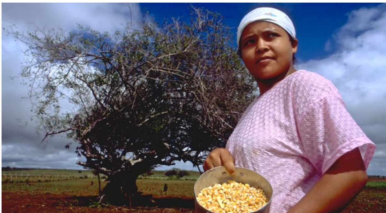
A woman plants maize in Poco Verde in the Brazilian state of Sergipe. Policies that improve producers' access to markets are crucial in efforts to tackle poverty and hunger.