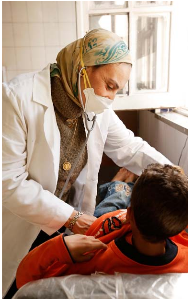
A health worker examining a TB patient. The Global Drug Facility helps drive universal access to anti-TB drugs, and supports the development of efficient national systems for their procurement and distribution.

The Global Drug Facility has laid a solid foundation on which progress can be based in the face of the challenges posed by ensuring access to anti-TB drugs. With an innovative Global Plan, assistance from the Stop TB Partnership, and new partners such as the Global Fund and UNITAID, the landscape is rich with potential for gains in the fight against TB.