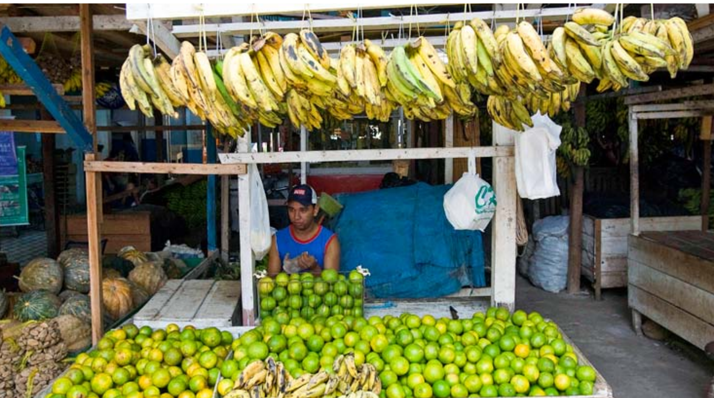
A variety of locally produced fruit for sale at a Brazilian market. The diversity of produce that smallholders can grow has been increased by the Food Acquisition Programme (PAA).

as matters beyond their control, such as weather-related damage to their crops.