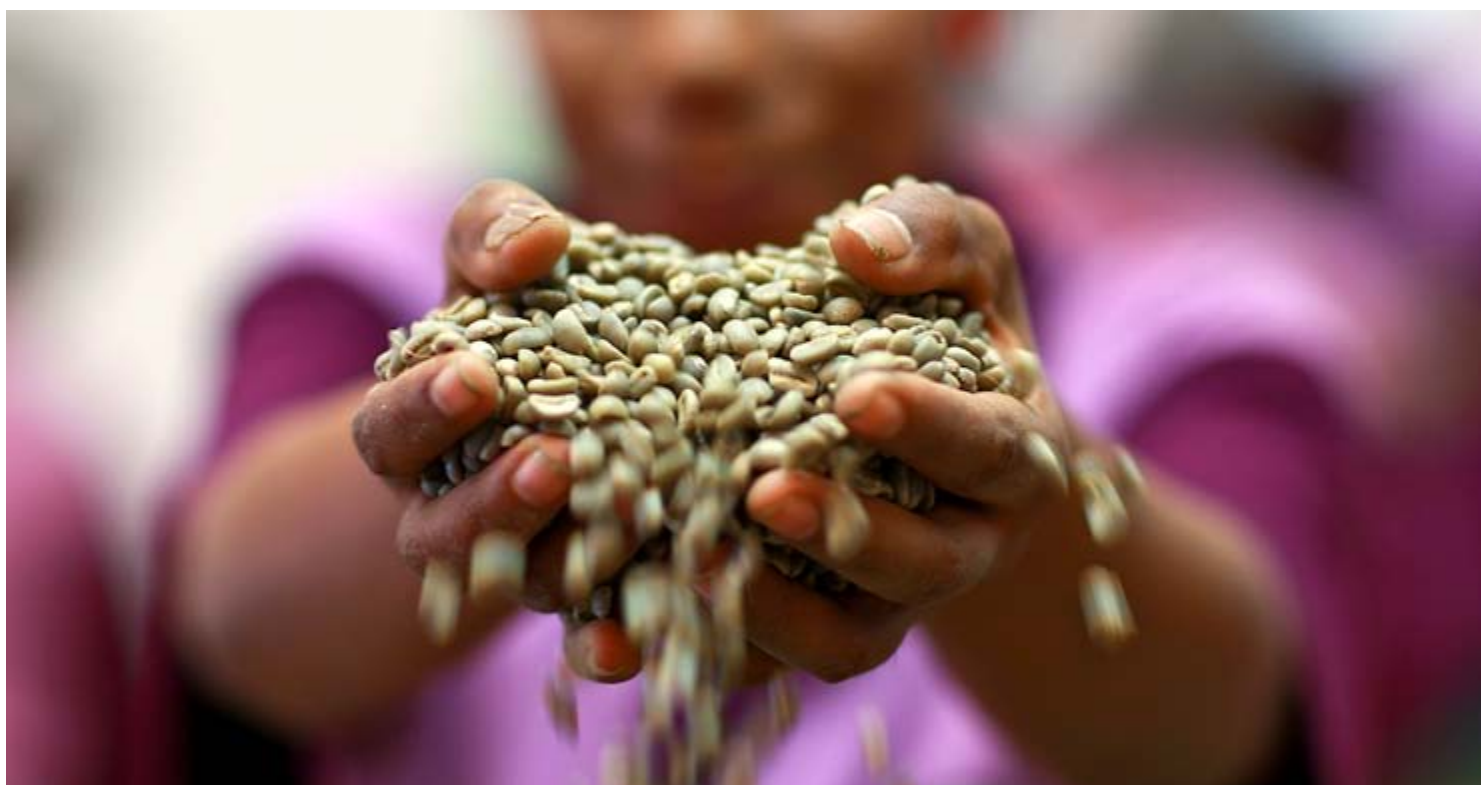
A number of developing countries, such as Timor-Leste, have decided to opt out of the GPA, in order to better protect key domestic industries such as coffee.

requirements. Furthermore, joining the GPA makes it harder to introduce and execute secondary policies through public procurement such as supporting minority businesses or environmental protection.