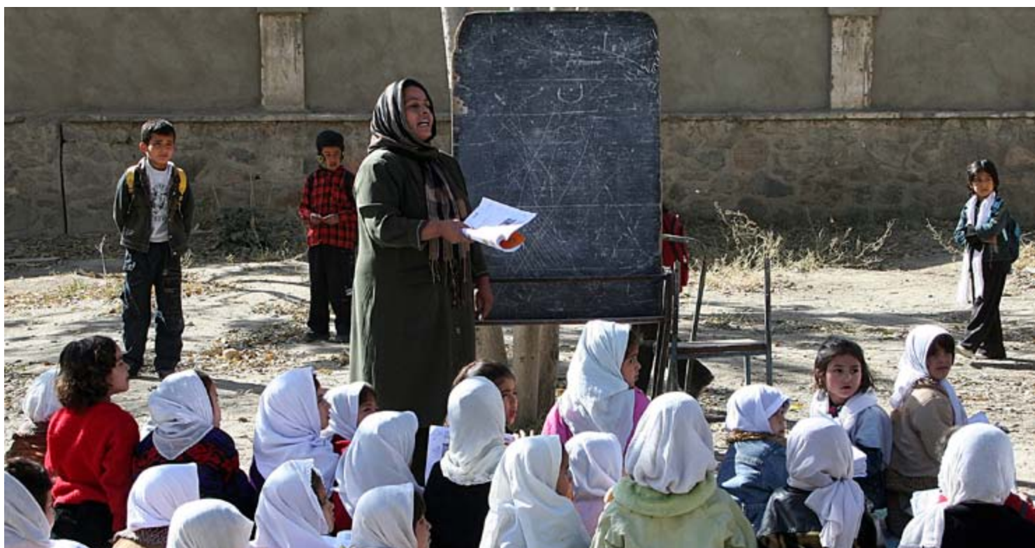
Afghan school children attending class with the support of the United Nations Children's Fund, which in 2008 enrolled nearly 340,000 girls in grade one. There are 6.2 million children today studying in primary and secondary schools across the country.

manufacturers to track progress and identify problems. Countless obstacles were encountered: obtaining exemption certificates; getting custom clearance on time; negotiating port charges; flooded roads; identifying local focal points and ensuring they were ready to receive the supplies and more.