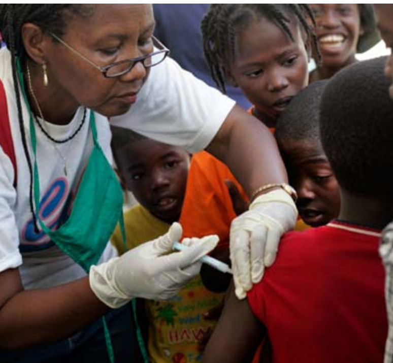
Cuban doctors administer diphtheria and tetanus vaccinations provided by the World Health Organization (WHO) to children at Delmas 33 IDP camp in Port-au-Prince for Haitians displaced by the earthquake.