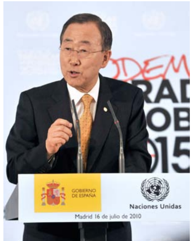
Secretary-General Ban Ki-moon speaks at the first meeting of the Millennium Development Goals (MDG) Advocacy Group in Madrid, Spain.

This publication describes a wealth of initiatives that can spur deeper thinking on the role of procurement in meeting development goals. I commend readers to use this volume as a launching point for future action.