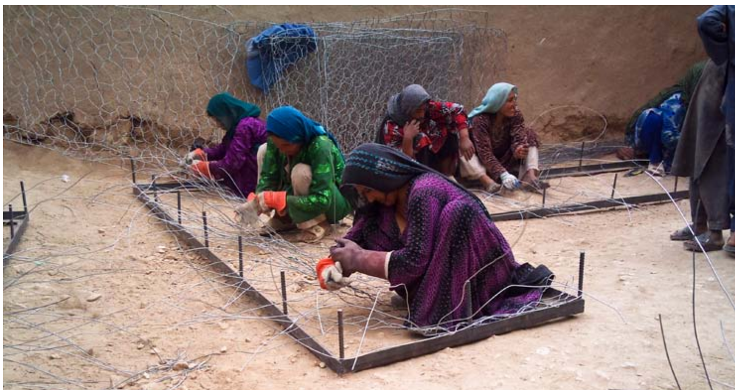
Women preparing wire baskets known as gabions as part of the Rural Access Improvement Project funded by Sida in northern Afghanistan. The gabions will be filled with stone and used to rehabilitate roads in the Sar-e-pul and Samangan provinces.

managers faced difficulties buying the necessary goods to construct the 113 kilometres of roads needed to link certain isolated communities. In particular, it was a challenge to find the hundreds of high quality gabion boxes (wire cages which are later filled with stone blocks) needed to create retaining walls. As they had already experienced success training local widows to provide the screened gravel necessary for construction, project managers decided to adopt a similar approach, which would also fulfil the project's cross-cutting aim to promote gender equity.