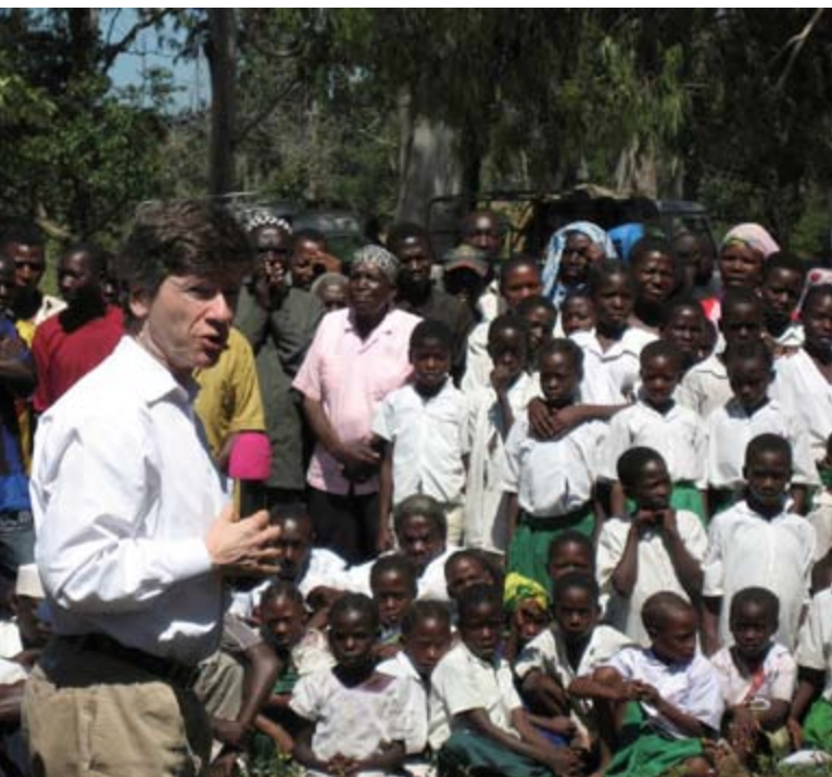
Jeffrey Sachs is internationally renowned for his work with international agencies on problems of poverty reduction, debt cancellation for the poorest countries and disease control.