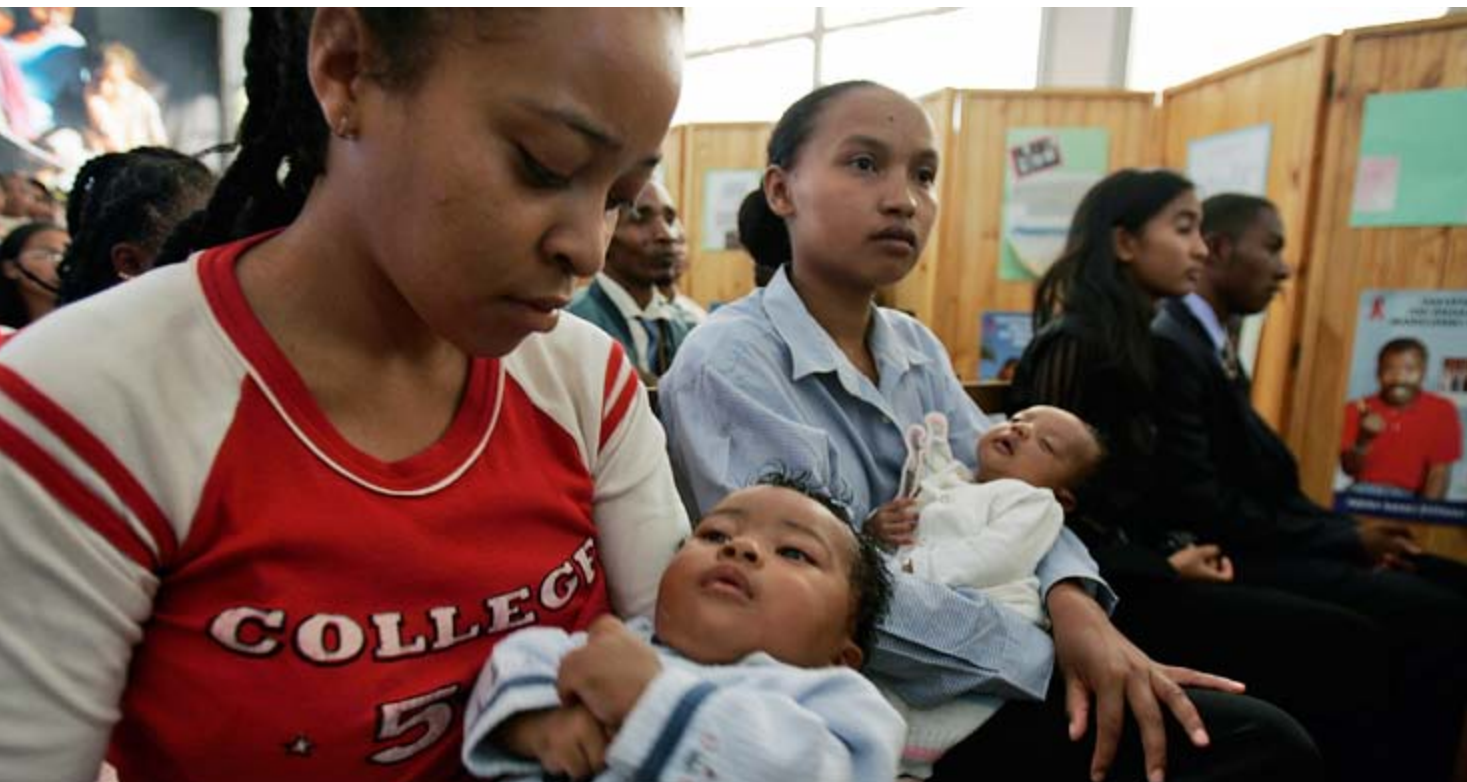
Mothers and their babies at a primary health centre ante-natal care site with voluntary counselling and testing, family planning and reproductive health in downtown Antananarivo, Madagascar.

is difficult for it to plan for customer demand, given that quantification for contraceptives is managed by the DFP. The data available to SALAMA come in the form of orders placed by its customers, and some customers are irregular in their ordering practices. Accordingly, SALAMA has to deal with a substantial number of emergency orders during the course of a year.