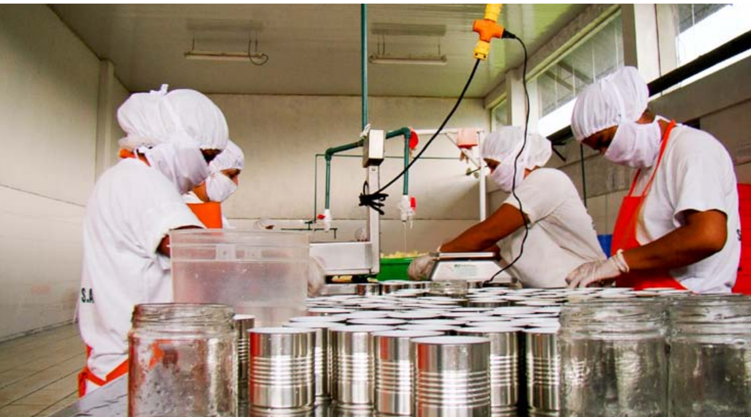
A small food processing business in Peru. When making procurement decisions, many public organizations give preference to local business to nurture small and medium enterprises (SMEs) with the underlying rationale that SMEs drive economic development.